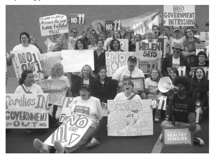
These are just SOME of the demonstrators from all the states—a lot more wouldn't fit into the camera frame!

On October 3rd, Nebraskans boarded a bus and traveled to Sioux Falls, South Dakota to join reproductive rights activists there. South Dakota is considering Measure 11, a ballot initiative that would virtually outlaw abortions, as the state intends to dare someone to sue and thus put reproductive rights back in front of the US Supreme Court. Nebraskans joined locals in canvassing, phone banking, assembling mailings, and even some demonstrations in an effort to educate voters about the need to vote down the initiative. Volunteers from the ACLU affiliates of Iowa, Kansas, Minnesota, Missouri, Montana, Wisconsin and Wyoming joined in the work.