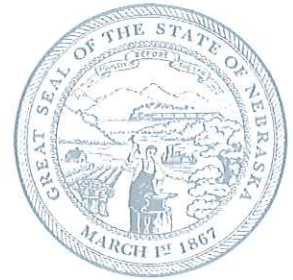
Pete Ricketts, Governor