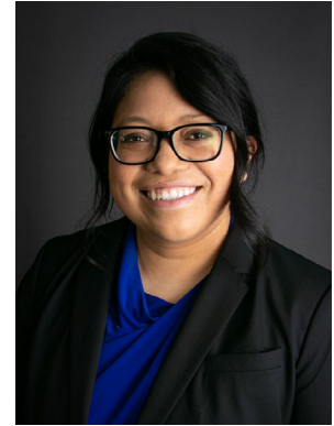
Author: Rose Godinez, ACLU of Nebraska Legal and Policy Counsel

The United States is home to immigrants from across the world who speak a variety of languages, millions of whom do not speak English as their primary language. 7 Nationally, more than 25 million people ages five and older were considered individuals who do not speak English as their primary